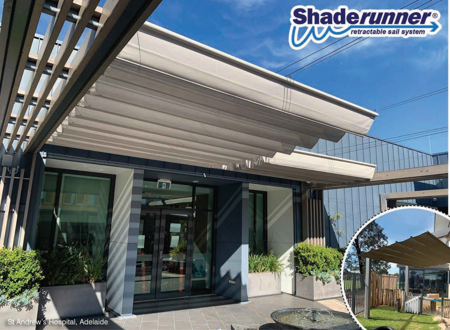
St Andrew's Hospital, Adelaide