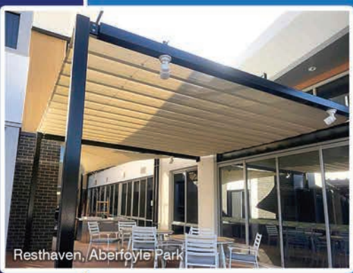
Resthaven, Aberfoyle Park