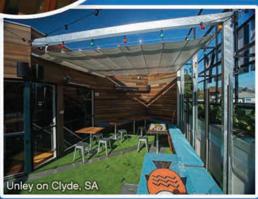
Unley on Clyde, SA