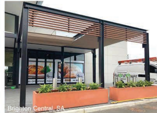
Brighton Central, SA

Versatile by design, the Shaderunner® is ideally suited to a range of structural support systems. The Shaderunner® is typically fixed to buildings, fascias, walls, posts, pergolas, custom structures or a combination of these - plus more.