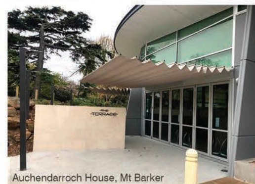
Auchendarroch House, Mt Barker