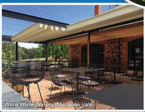
Wirra Wirra Winery, McLaren Vale