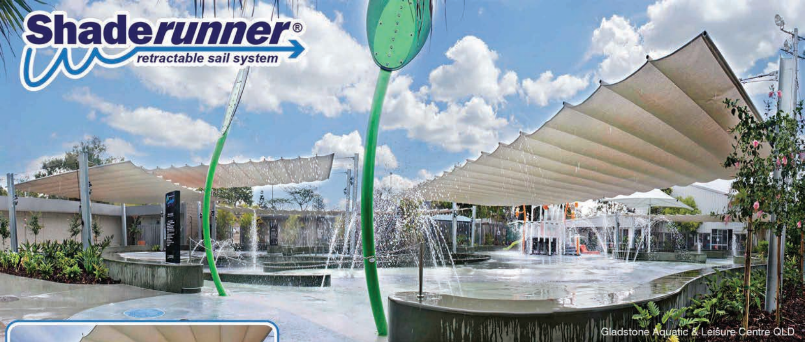
Gladstone Aquatic & Leisure Centre QLD