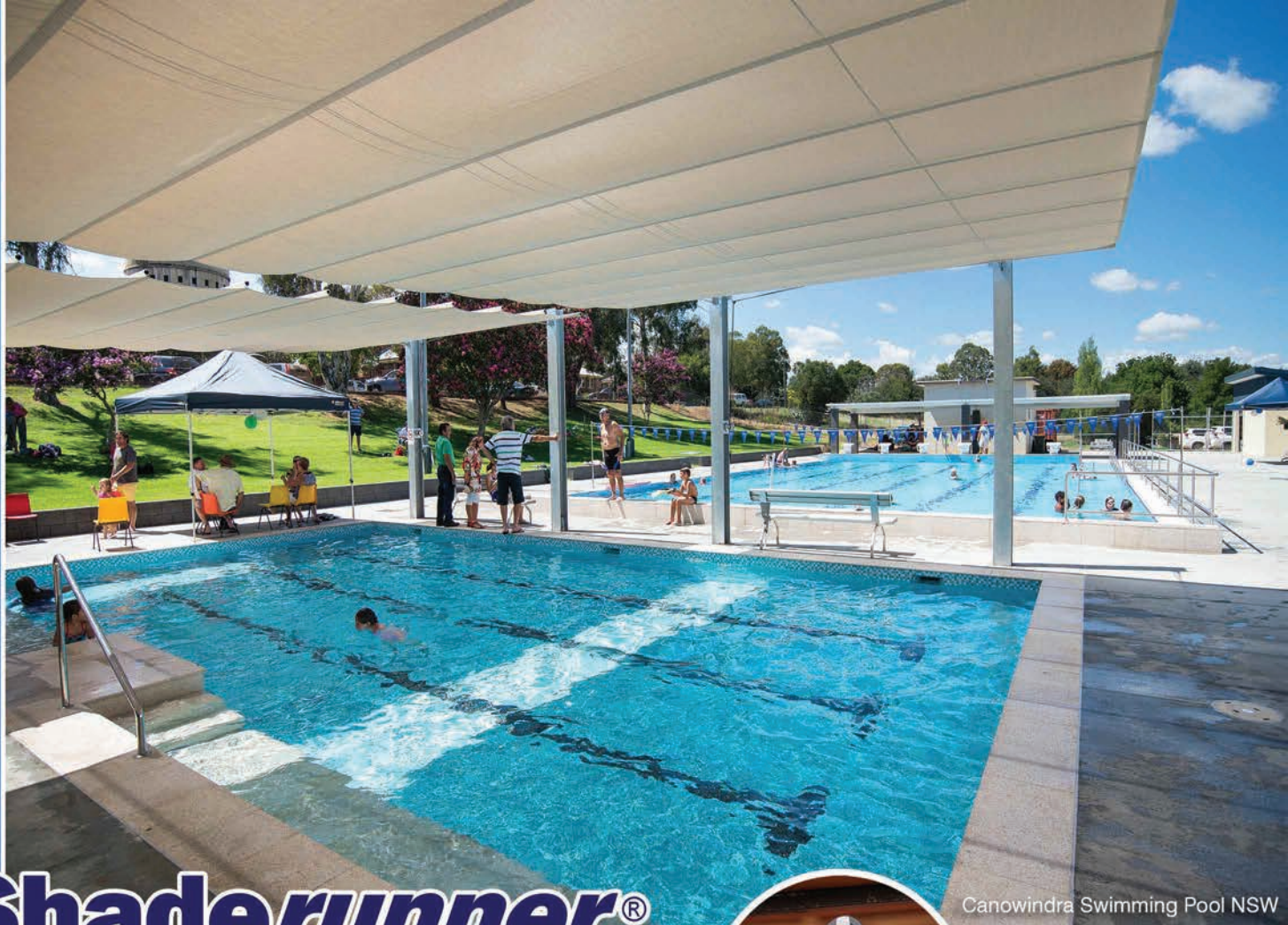
Canowindra Swimming Pool NSW