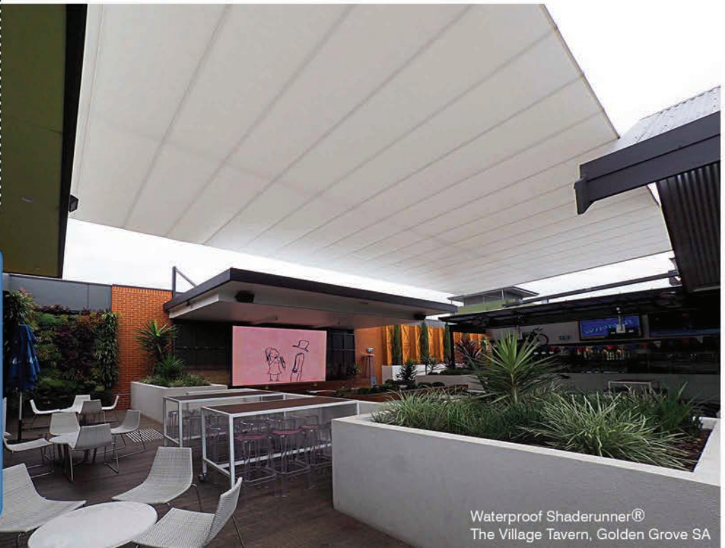
Waterproof Shaderunner® The Village Tavern, Golden Grove SA